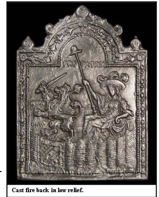
Cast fire back in low relief.

stories. In the case of the Horne Point fireback, the scene depicts the Maid of Dort (Dordrecht), the national symbol for Holland, and the Lion of the Provinces sitting within a palisade. The Maid holds a hat on the point of a spear while the Lion holds a sword and seven arrows representing the seven Provinces. This image symbolizes Holland, surrounded by her fortified frontiers, maintaining liberty by the force of arms. Both the sword and pomegranates along the border (symbols of the unity of many under one authority) allude to the struggle for unification of the Provinces. The scene is topped by the motto Pro Patria, 'for the fatherland.' Dutch themes were not out of place in North America. After all, New York was a Dutch colony and called New Amsterdam until 1674. This motif is a legacy of the colonists' European heritage.