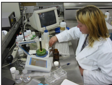
A conservator tests chloride levels

The Maryland Archaeological Conservation Laboratory is offering free monthly behind-the-scenes tours. Upcoming dates include Thursday, June 25th; Friday, July 24th; and Friday, August 21st. Tours are at 10:00 am and 2:00 pm. No reservations are required.