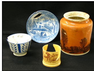
19th-century ceramics from the MAC Lab

Another new initiative by the Lab is a website on wood and wood charcoal identification. Funded by a grant from the National Park Service's Chesapeake Bay Gateways Network, this online resource ( http://www.jefpat.org/Wood & Charcoal Identification/Wood and Charcoal ID Introduction.htm ) will be an invaluable