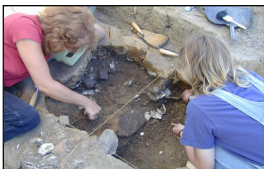
Volunteers help excavate a site.

JPPM and the Friends are also hosting a six-month speaker series called “From Boats to Bones: Archaeology is in the Details,” which began at the Friends Annual Meeting on May 8. The series features prominent speakers and topics such as forensic anthropology and marine archaeology. The dates for these talks can be found on page 4 of this newsletter.