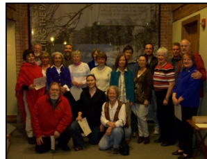
Group picture at Behind-the-Scenes Tour of the new FAQ Archaeology exhibit.