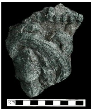
Fragment of head from cast iron fireback found at Horne Point.

In 1976, excavations took place at the Horne Point site located on the south bank of the Choptank River in Dorchester County, Maryland. Archaeologists discovered a dwelling not previously on record, but found to belong to a family of landed gentry, which occupied the area during the late 17th and 18th centuries. The house burned around 1770 and was never rebuilt, thus preserving the contents of the home in layers of charcoal and plaster. Among the artifacts recovered from the site were a copper alloy tea set, thimbles and buttons, glass and ceramic vessel fragments, iron keys and tools, and fragments of a cast iron fireback. Iron firebacks are a common feature in many historic homes across Europe and North America.